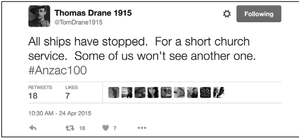
Fig. 4.1. @TomDrane1915, Tweet, 24 April 2015. Screenshot

2015 also saw the emergence of a new form: the historical avatar. Digital technology has enabled the reanimation of historical figures into online ‘presences’. Social media further enables the active ‘participation’ of animated avatars into a ‘live’ recreation of narrative and temporal experience. News Corp Australia’s AnzacLive embraced this opportunity. The project took the diaries of nine prominent Australian Gallipoli diarists, and with the augmentation of Facebook profiles, reanimated these characters. Historical Gallipoli ‘diary’ entries from 1915 were posted by the character’s Facebook profiles (Fig. 4.2) on their timelines on the same dates and times 100 years hence. The ‘timeline’ nature of a Facebook feed provided the temporal space for these characters to intersect on a followers’ ‘feed’ in parallel time to their experience on Gallipoli in 1915. AnzacLive delivered integrated content on social media platforms Facebook, Twitter, and Instagram, an explanatory website, a live blog on 25 April, and the news.com.au web page to tell the story of the Anzac landing. 43 In collaboration with the cultural institutions who house the diaries, the State Library of NSW and the Australian War Memorial, News Corp told the story of the Anzac landing from the diarists’ entries ‘as if they are alive and posting right now’. 44